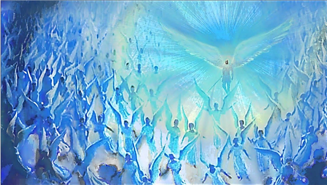
All Beings were created perfectly.