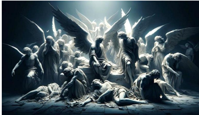
Table of Content – The Fallen Angels – who are they?