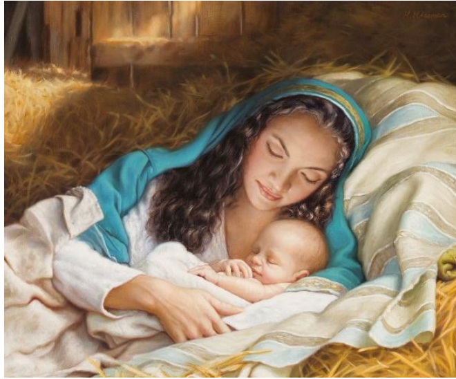
Mary, Did You Know? - YouTube