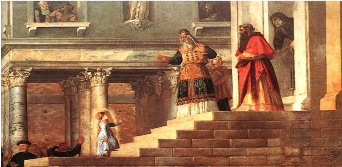
Mary enters the Temple and is swallowed up by the darkness

The High Priest looks at the little Girl and smiles. She must look very tiny at the foot of a flight of steps worthy of an Egyptian temple! He lifts his arms to the sky in prayer. They all bow their heads in perfect humility before the priestly majesty communicating with the Eternal Majesty.